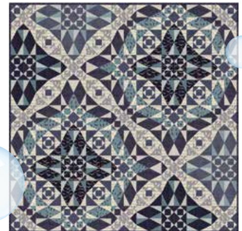
JC 159 / JC 159G Sailing the Blue Size: 72" x 72"