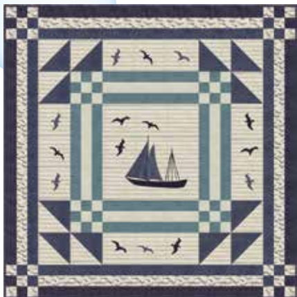
JC 161 / JC 161G Sail Away Size: 68" x 68"